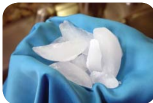
Use an ice pack